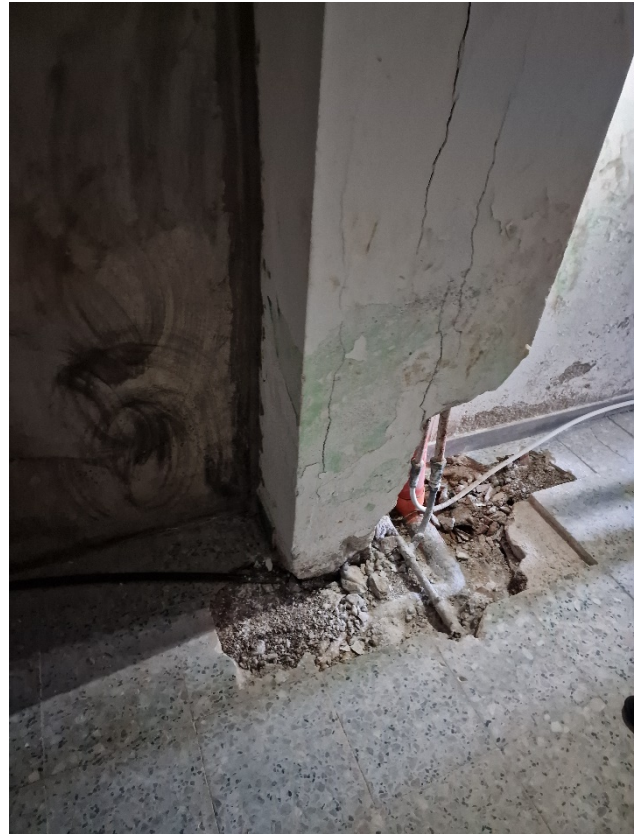
Lotto 2: Locale deposito foglio 11 part. 368 sub 2 Cat C/2