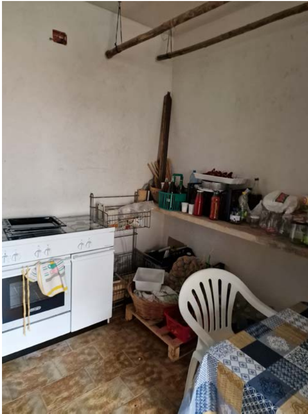
Lotto 3: Appartamento foglio 11 part. 368 sub 3 Cat A/7