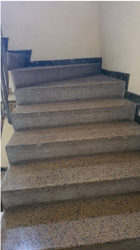
Fig. 32 part. 338 sub 7 e cantine al sub 9