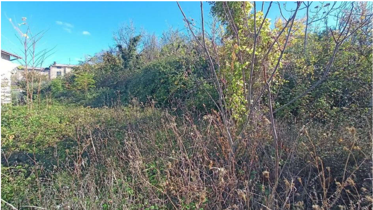
5. Accesso alla perticella 223