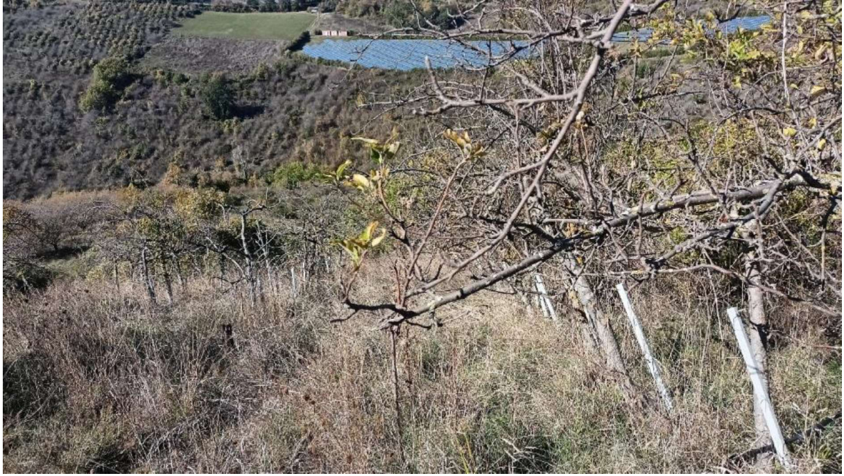
4. Dettaglio impianto