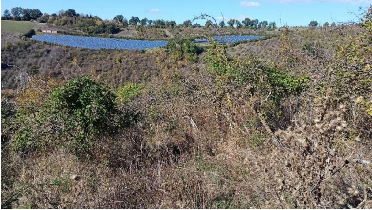
2. Limite Est Part. 223