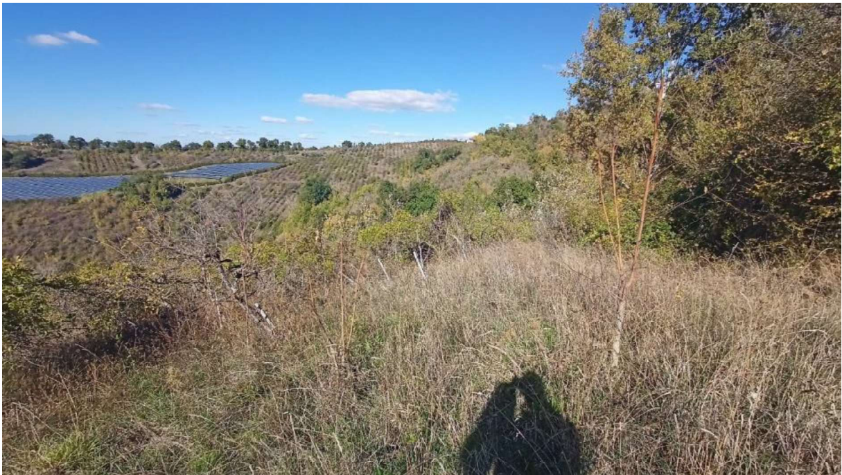
3. Limite Est