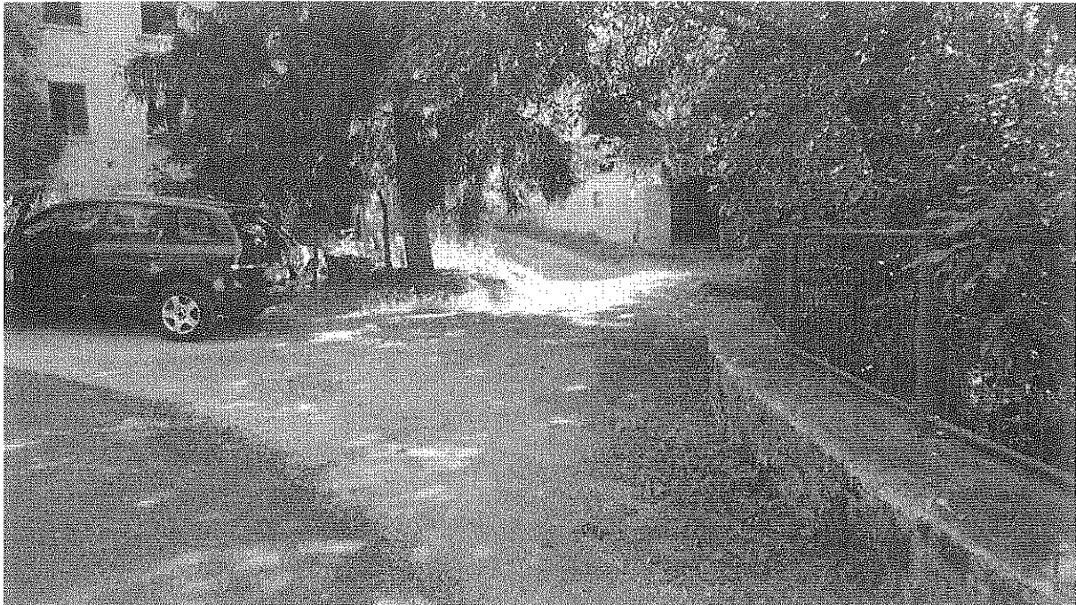
FOT O – 1 – ACCESSO DA STRADA COMUNALE