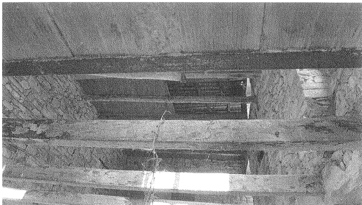
FOT O – 7 – IMMOBILE FG 104 – MAPP 848