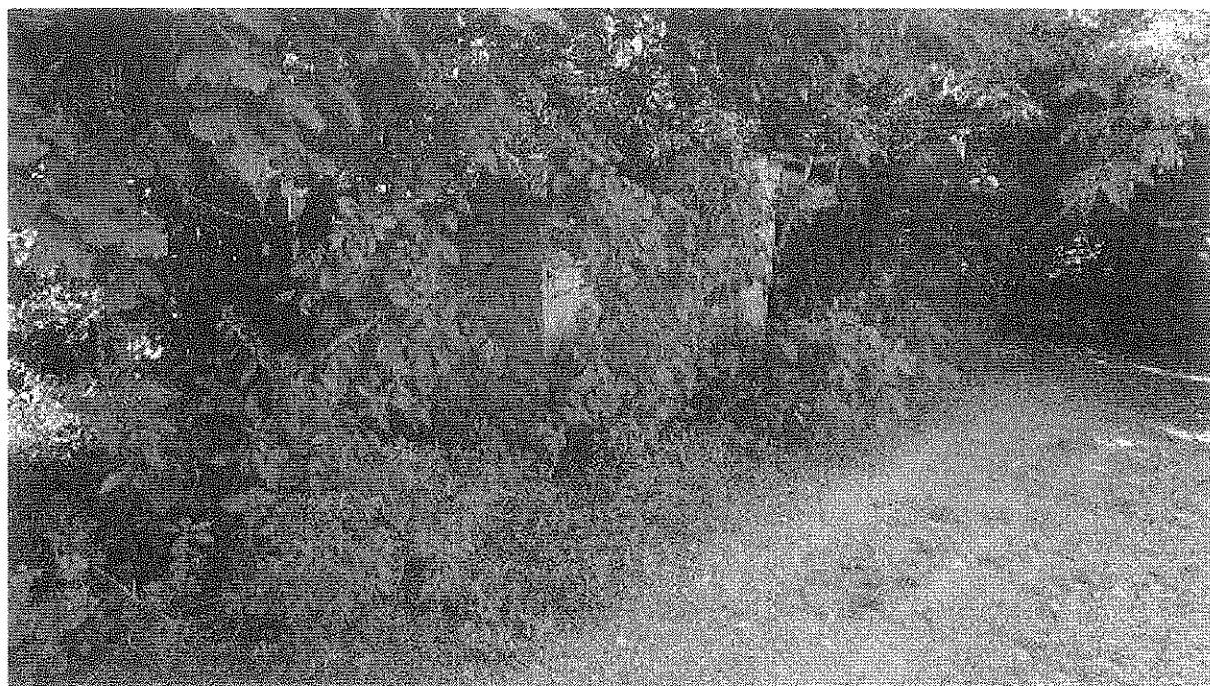
FOT O – 8 – BOSCO CEDUO FG 104 – MAPP 668