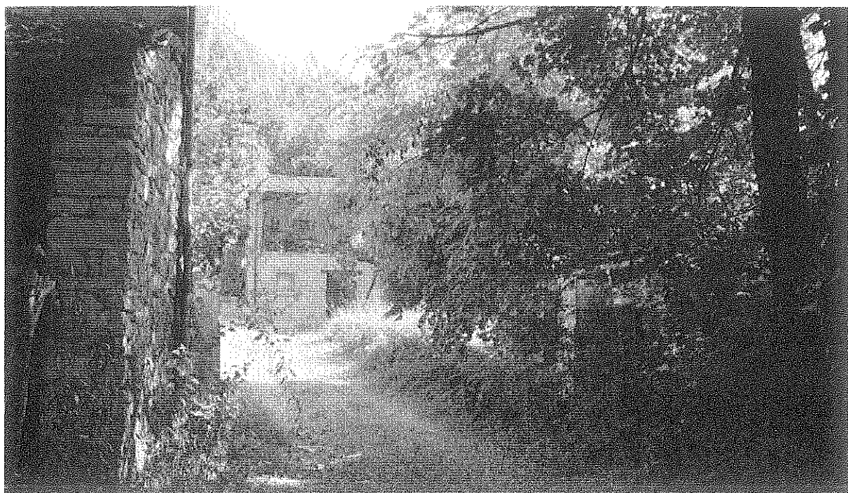
FOT O – 2 – STRADA DI ACCESSO - BOSCO CEDUO FG 104 – MAPP 668