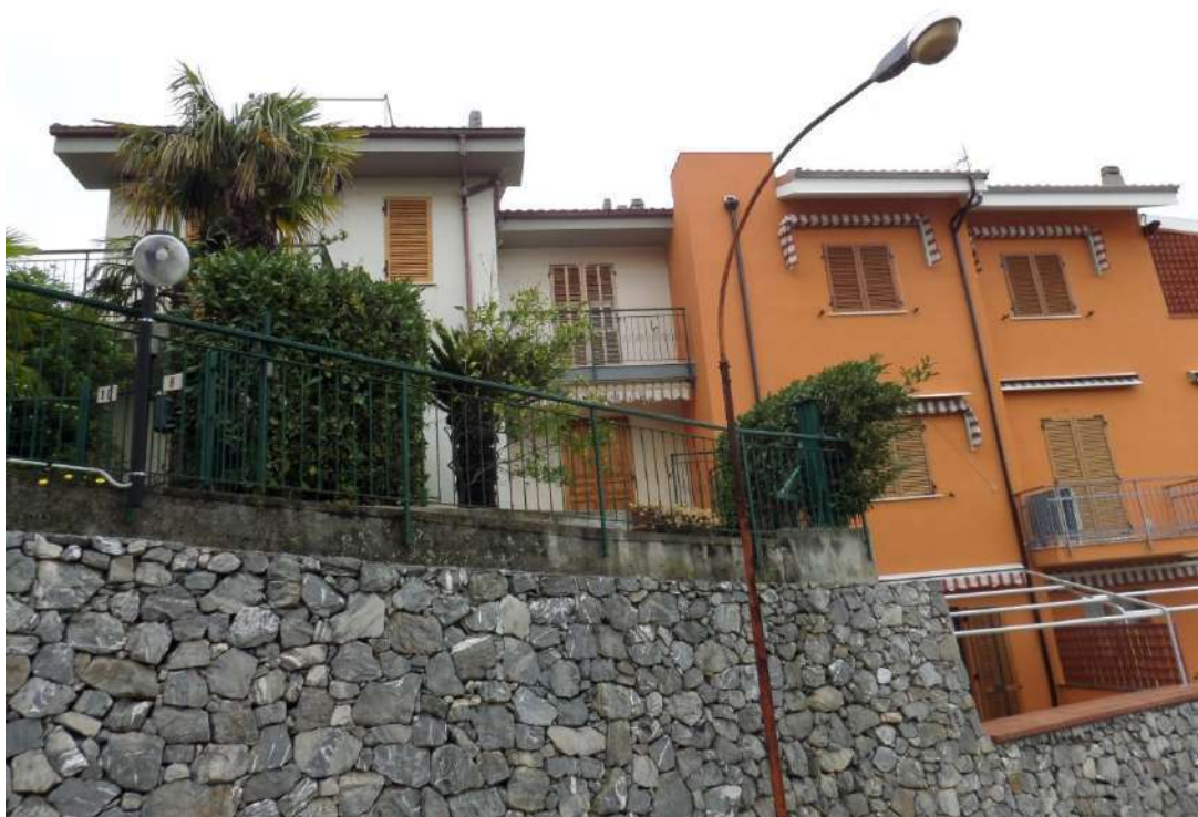
Fronte Ovest (Via San Francesco)