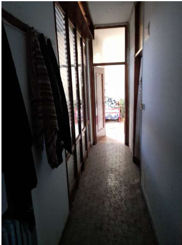
CORRIDOIO PIANO PRIMO