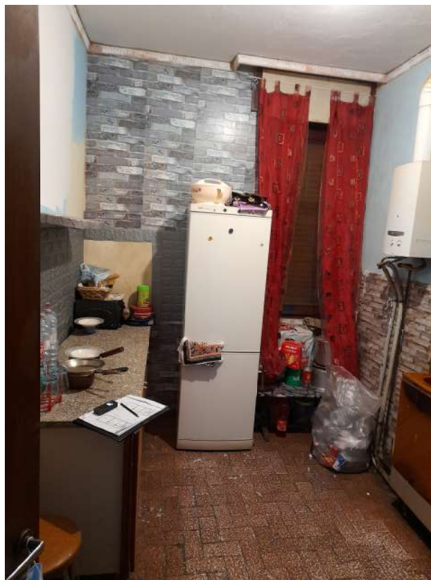
CUCINA PIANO SECONDO