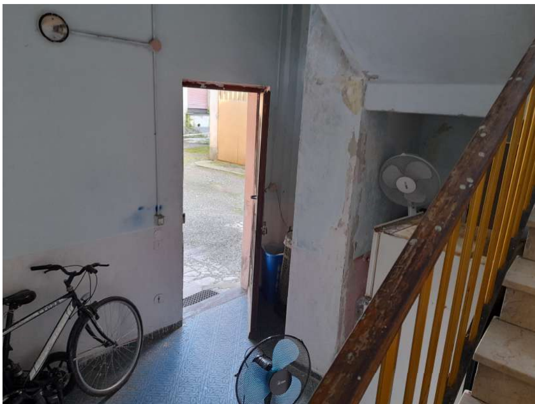
INGRESSO AL FABBRICATO