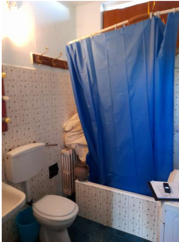
BAGNO SOPRA VANO SCALA