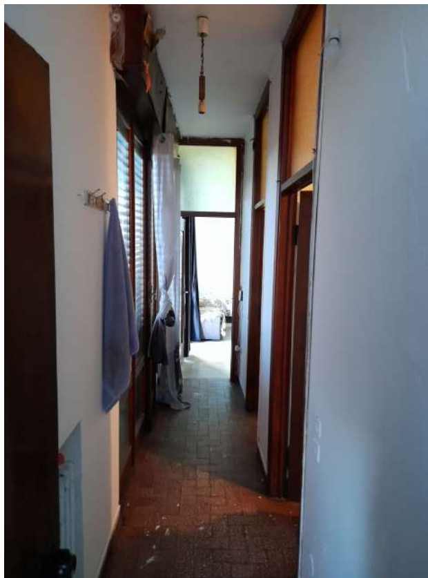
CORRIDOIO PIANO SECONDO