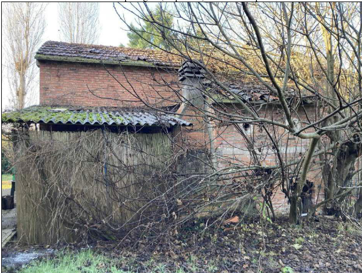
Foto 22 - manufatto precario