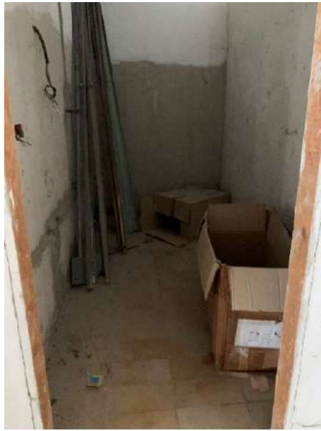
PIANO TERRA SUB 70