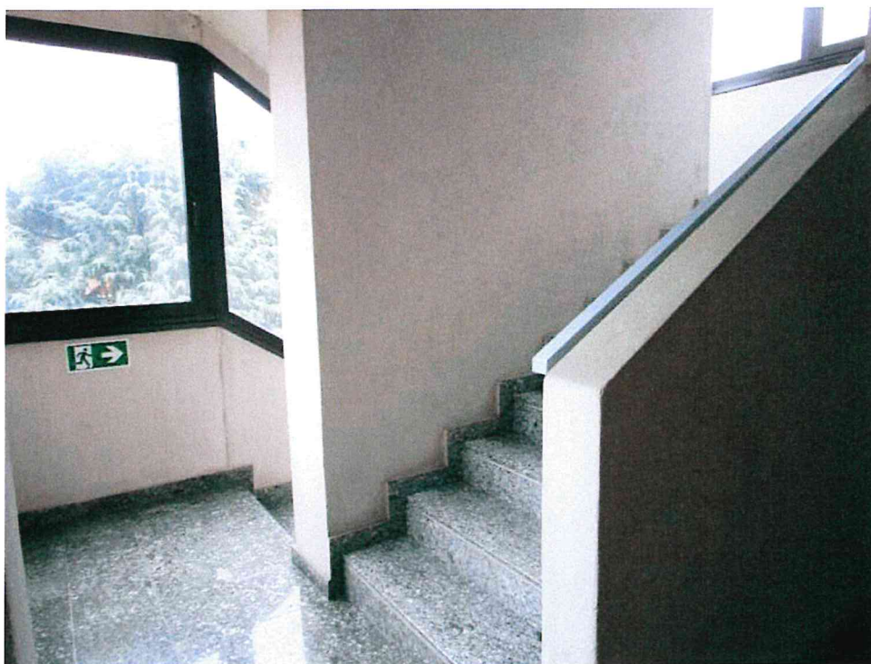
Accesso piano cantine/box