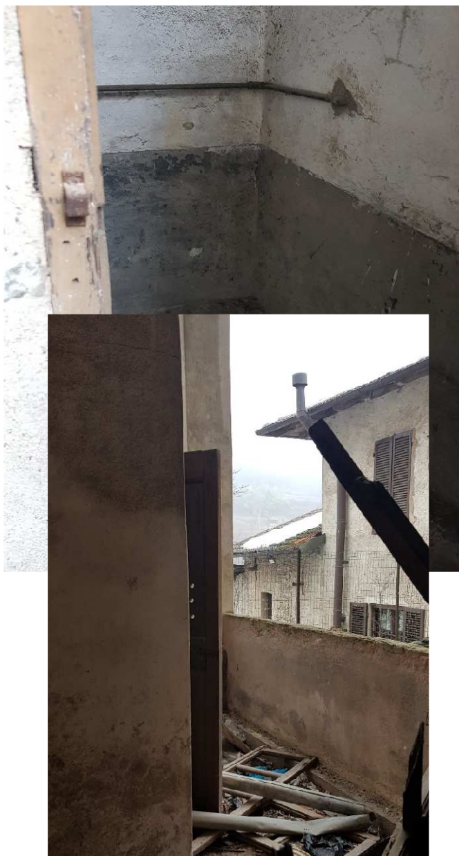
Latrine sul balcone