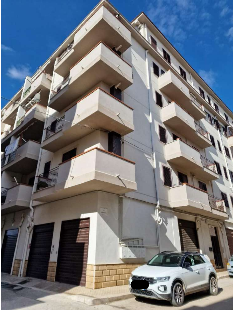
Angolo nord-est dell'edificio