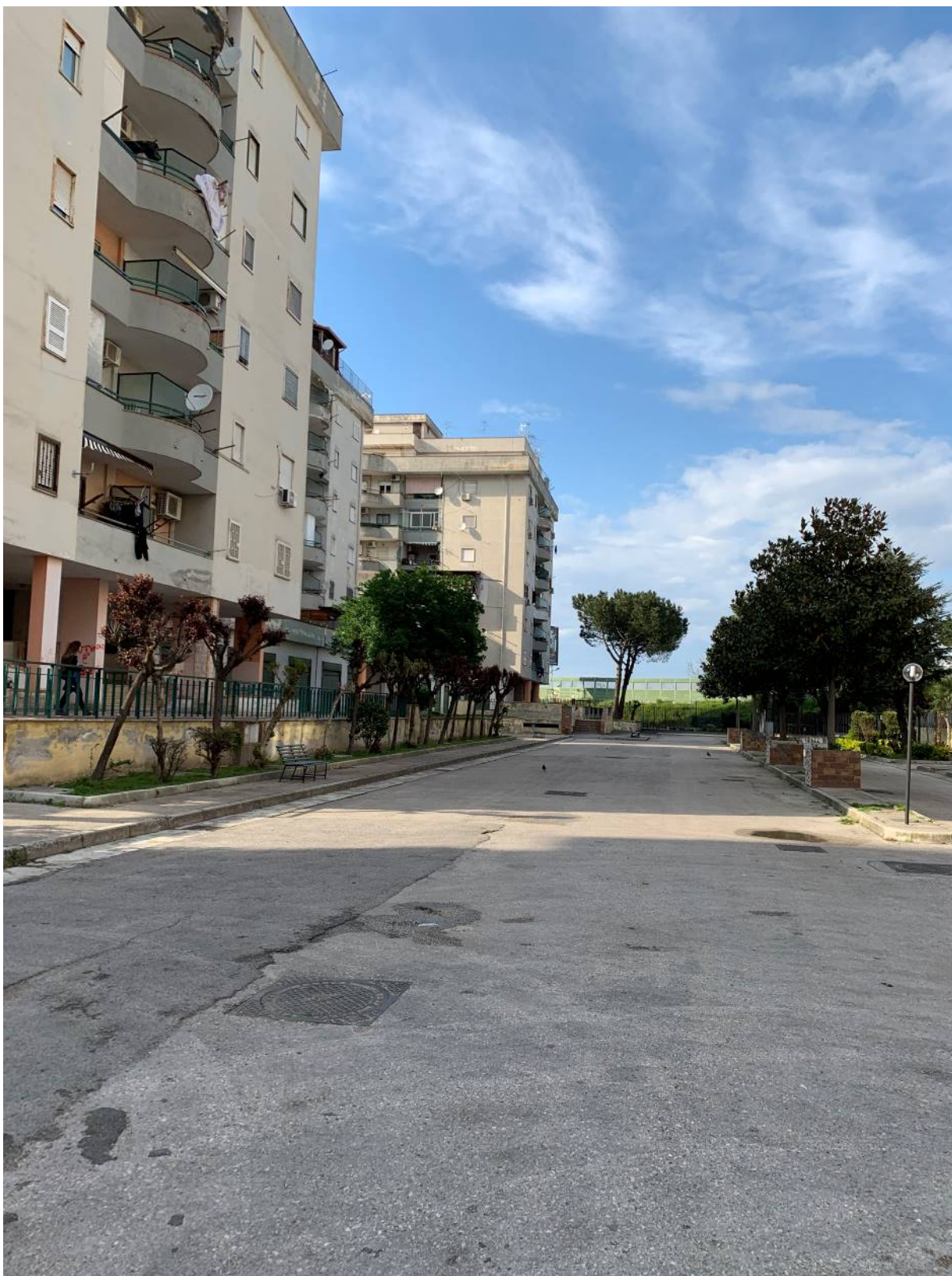
Vista dal viale condominiale del Parco