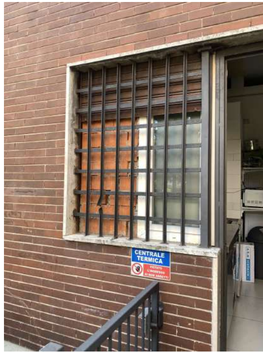
rampa esterna al condominio con ingresso al piano cantinato