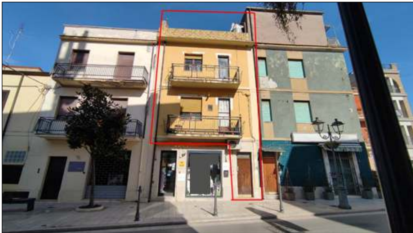
LOTTO n°2 – Comune di San Salvo, Fg 7 part. 762 sub 7