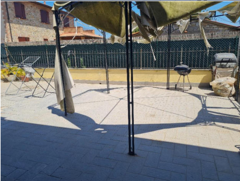
Area posteriore di pertinenza esterna – p.lla 1391