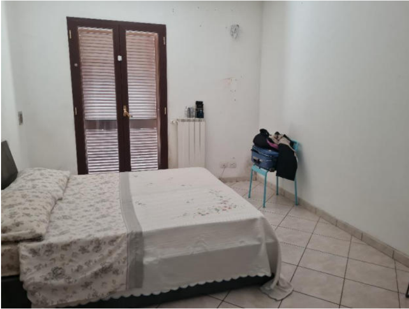
Camera da letto (L1)