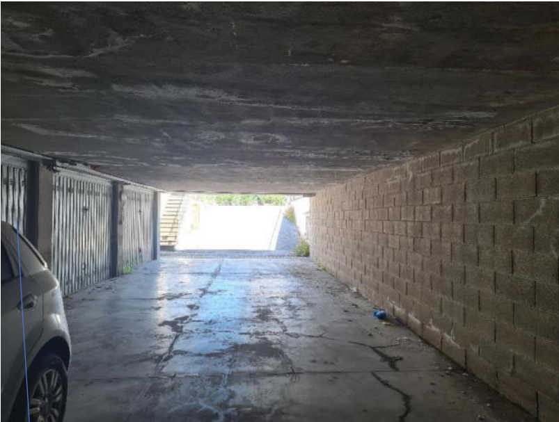
Serranda di accesso