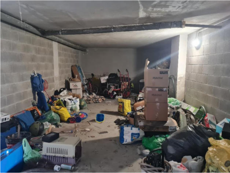
Box-auto sub 5 – lotto 2