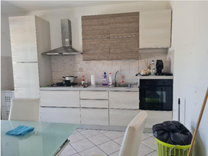
Angolo cottura – ingresso soggiorno-living – sub 14 – lotto 2