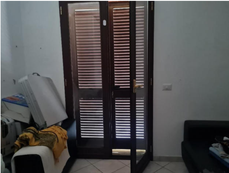
Camera da letto (L)