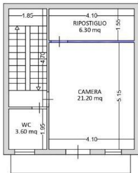
PIANO PRIMO H=3.00 m