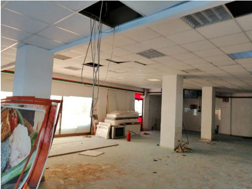
Sub 27 - 2