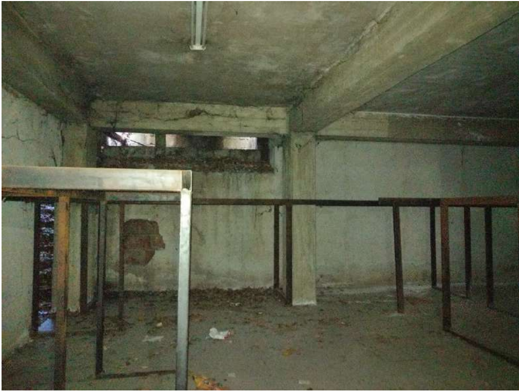
Sub 38 - 5