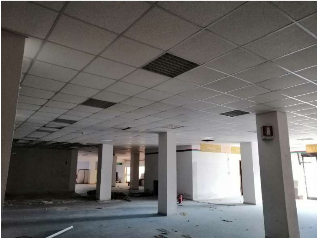
Sub 27 - 5