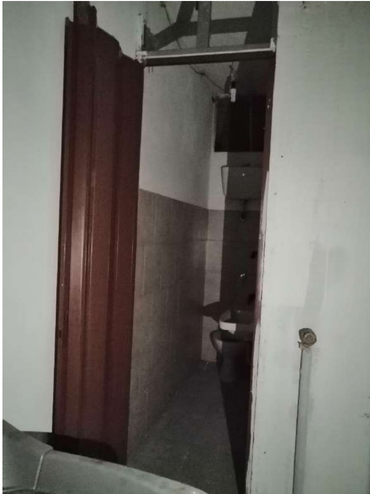
Sub 38 - 10