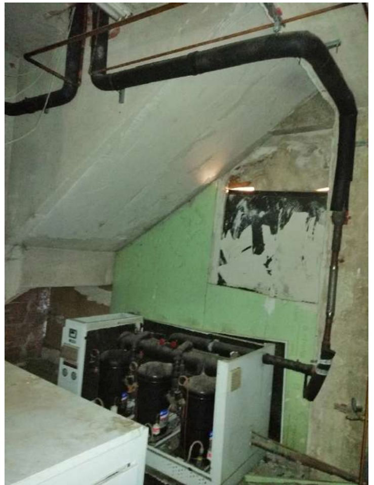
Sub 38 - 12