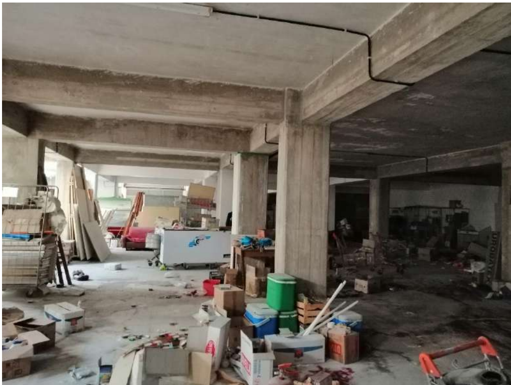
Sub 38 - 2