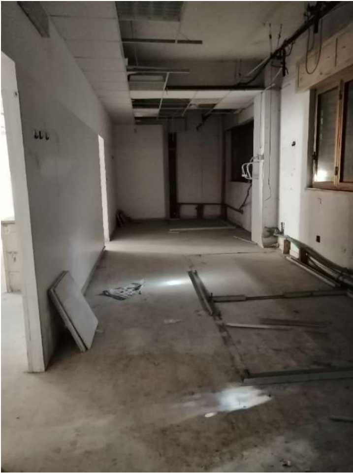
Sub 27 - 7