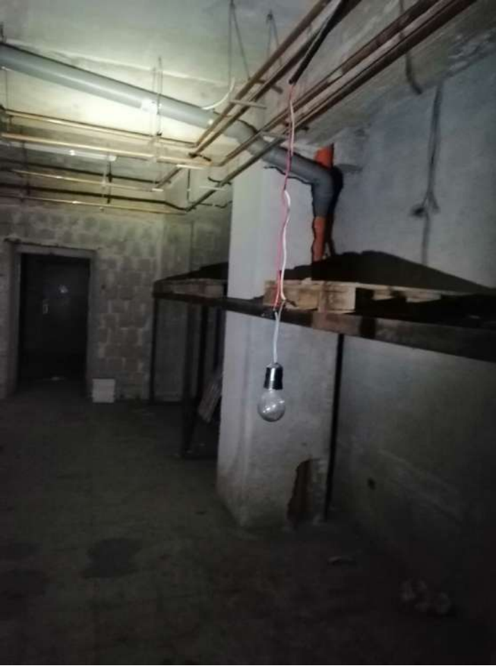
Sub 38 - 7