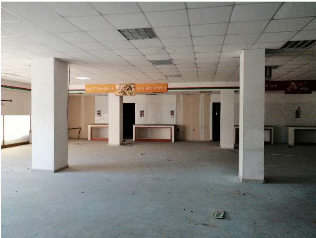
Sub 27 - 4