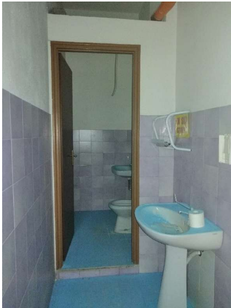
Sub 27 - 6