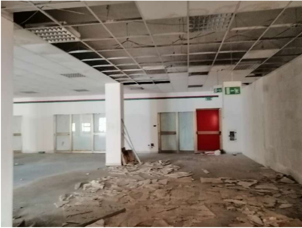
Sub 27- 3