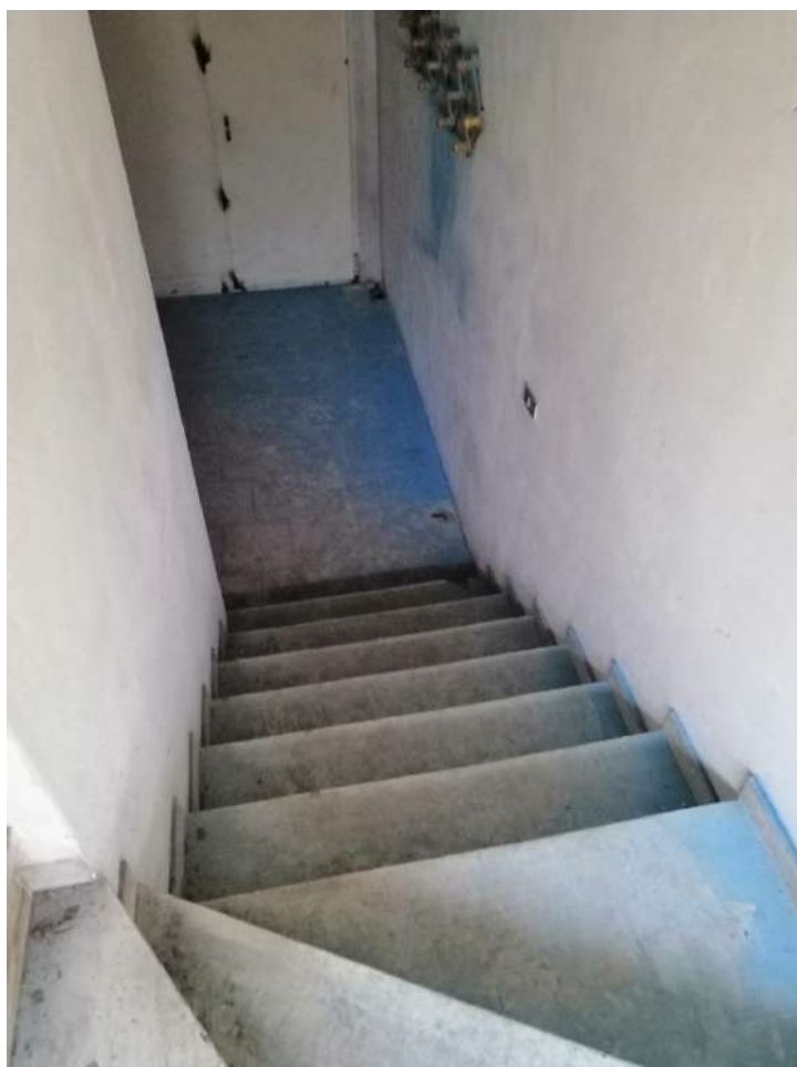
Scala - 2