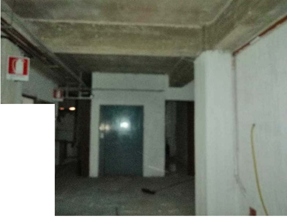
Sub 38 - 9