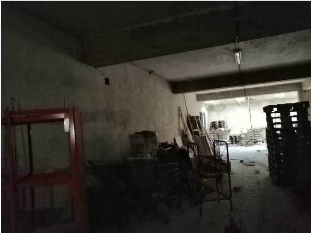
Sub 38 - 4