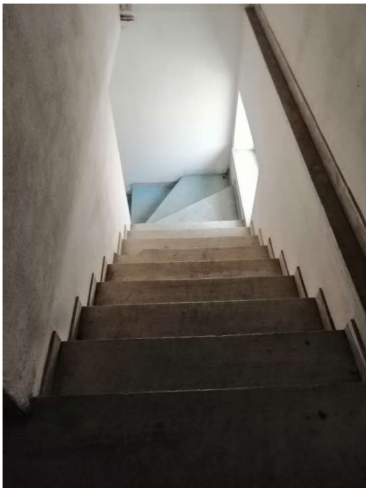
Scala - 1