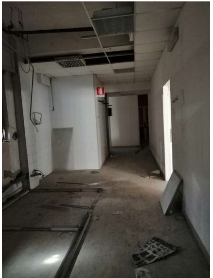
Sub 27 - 8