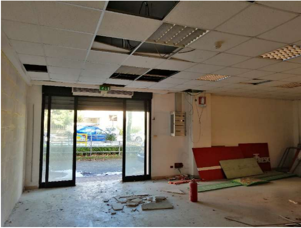
Sub 27 - 1