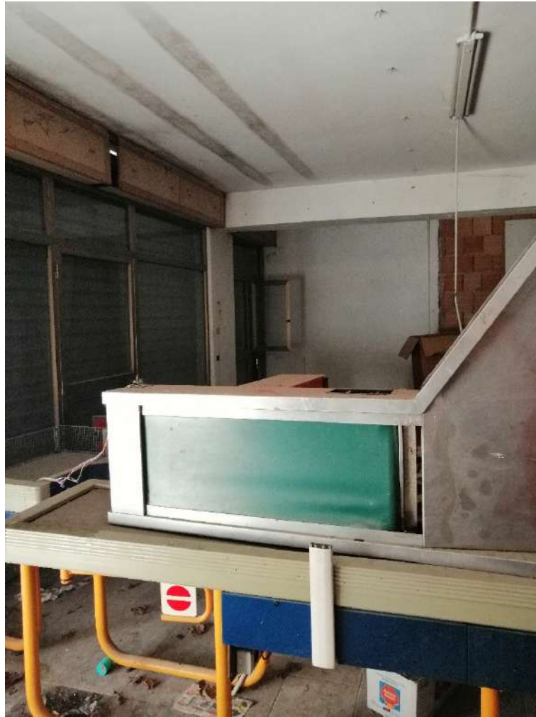
Sub 38 - 1