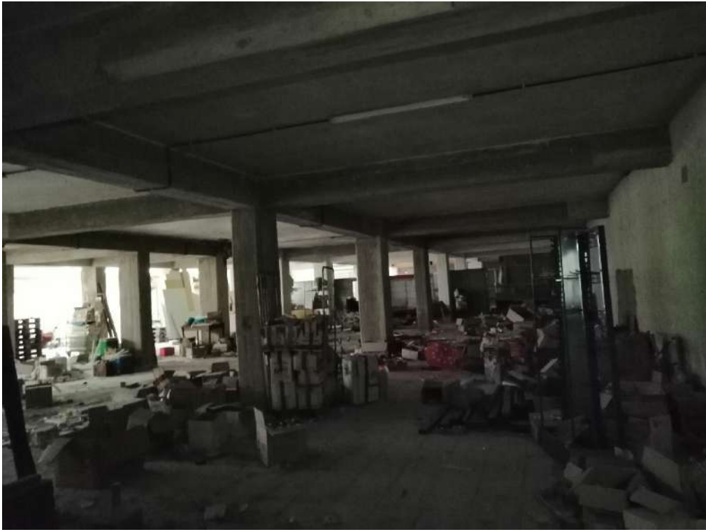
Sub 38 - 3