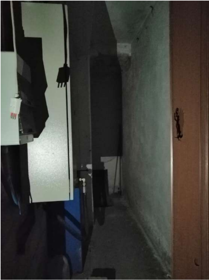
Sub 38 - 11