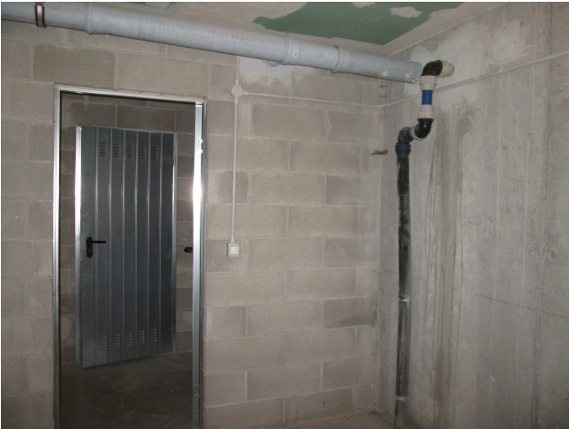
LOTTO 023.A1. COMPARTO C box 1490/16