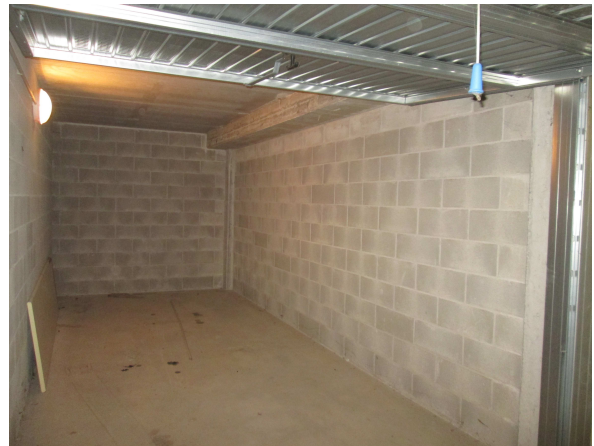
LOTTO 023.A2. COMPARTO C box 1490/42