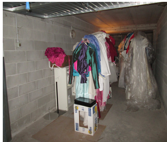
LOTTO 014.A2. COMPARTO B box 1490/32