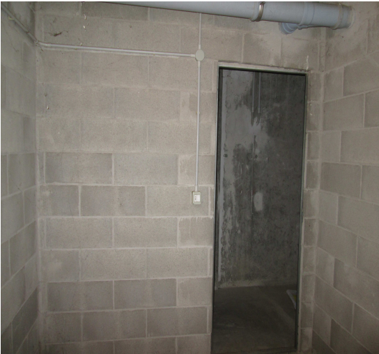
LOTTO 014.A1. COMPARTO B box 1490/3