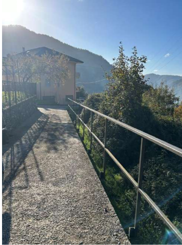
RIPRESE DEL MAPPALE FG 41 PART 61 TERRENO