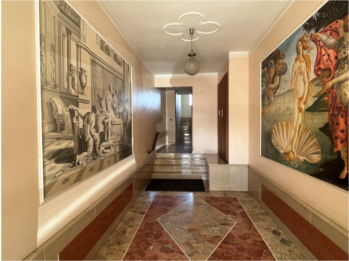
Figura 3 androne condominiale