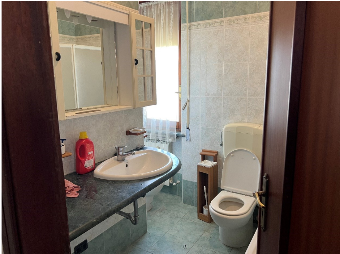
Figura 9 bagno