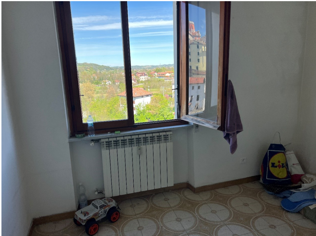
Figura 8 camera