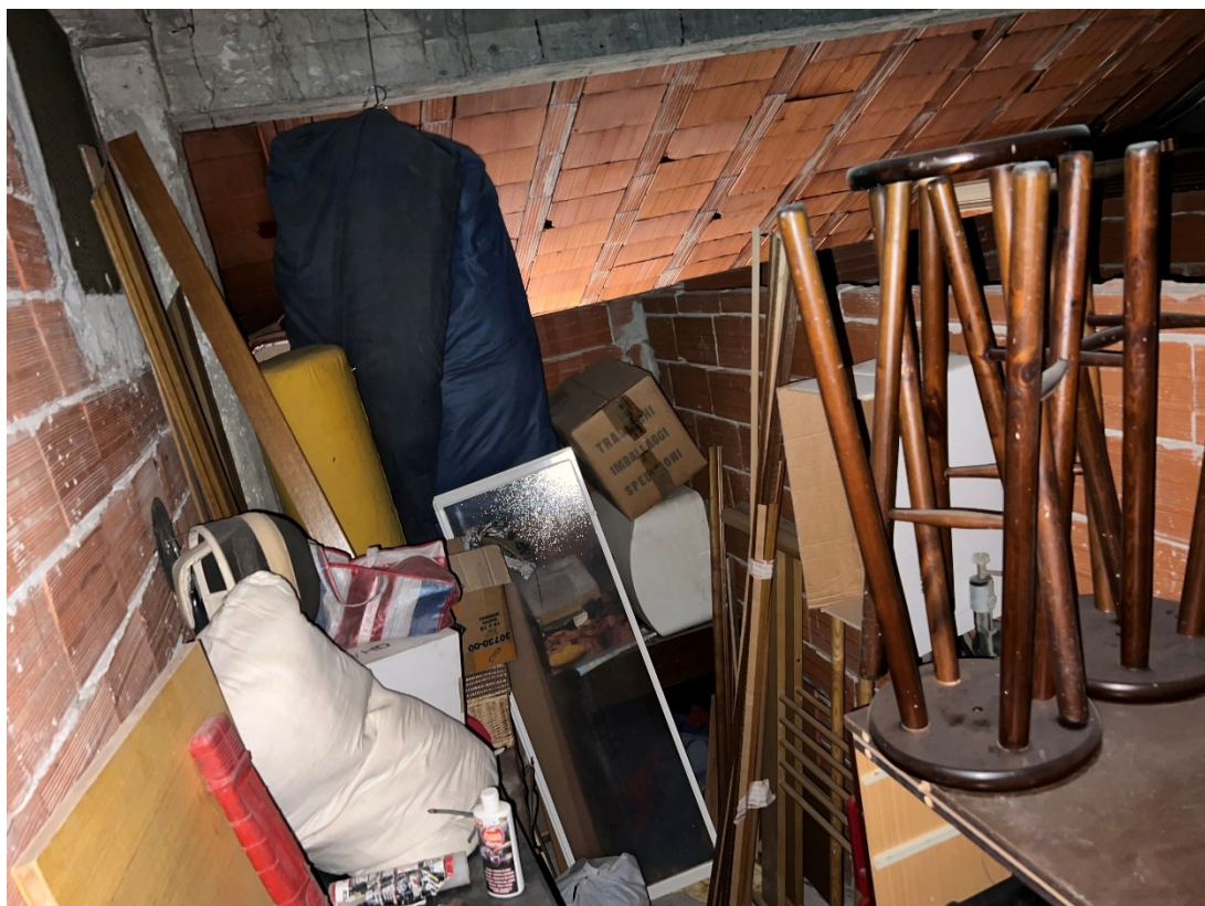
Figura 10 solaio