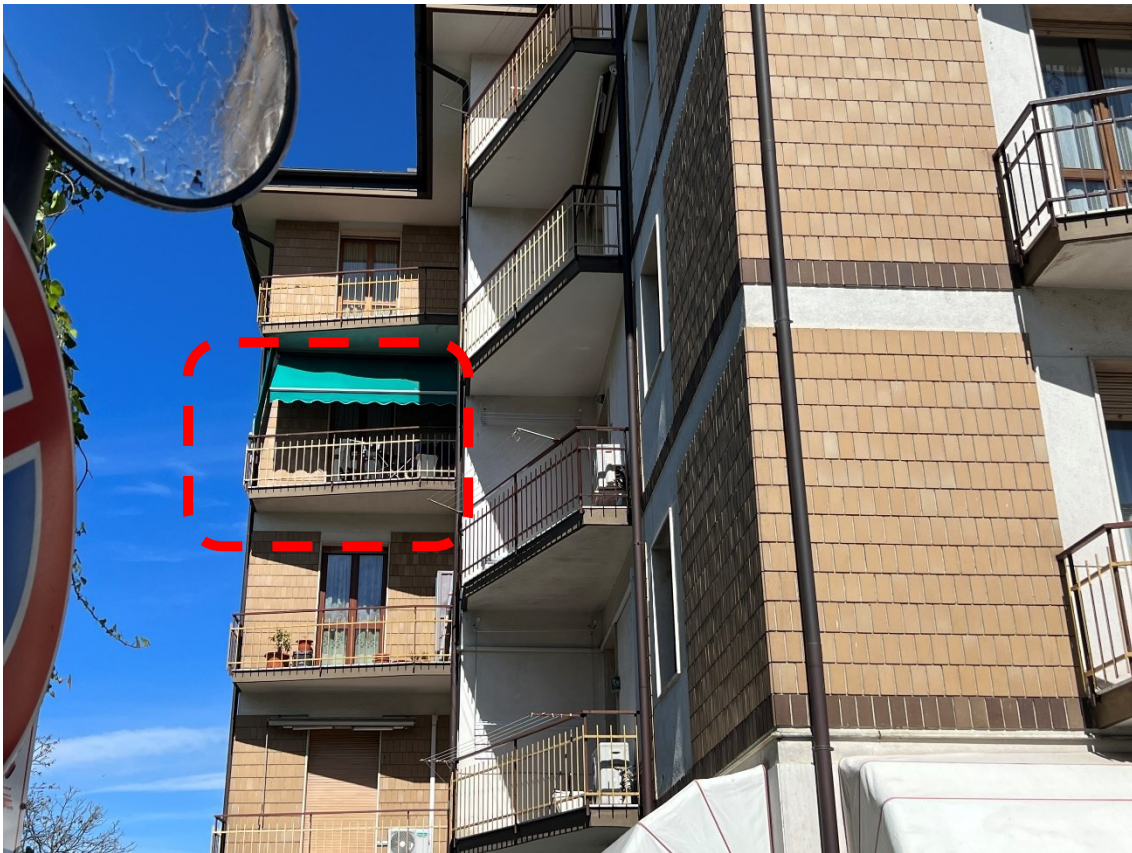
Figura 2 dettaglio alloggio