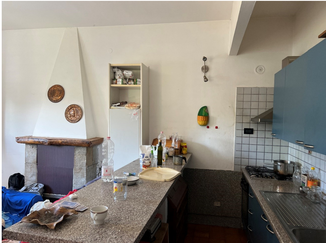
Figura 6 cucina