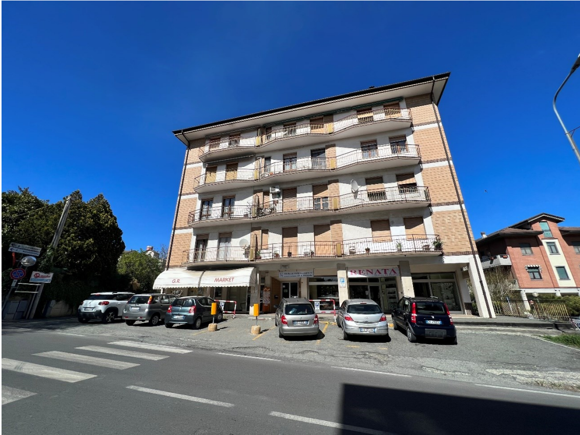
Figura 1 vista stabile condominiale