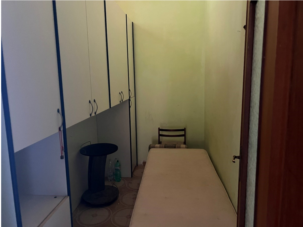
Figura 7 camera