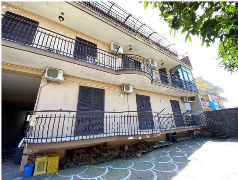
Esterno lato nord