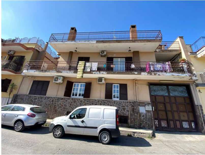
Esterno lato sud