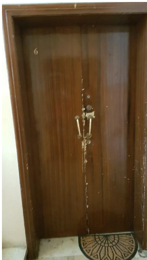
ACCESSO DA VANO SCALE