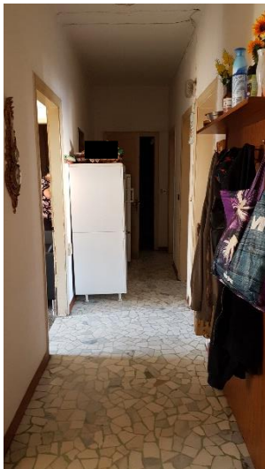
CORRIDOIO - INGRESSO