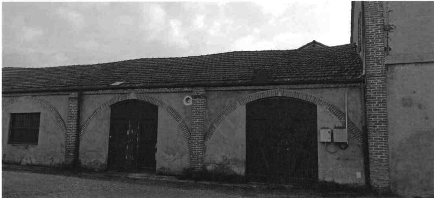
VISTA FACCIATA PRINCIPALE DA CORTILE COMUNE SUB. 19