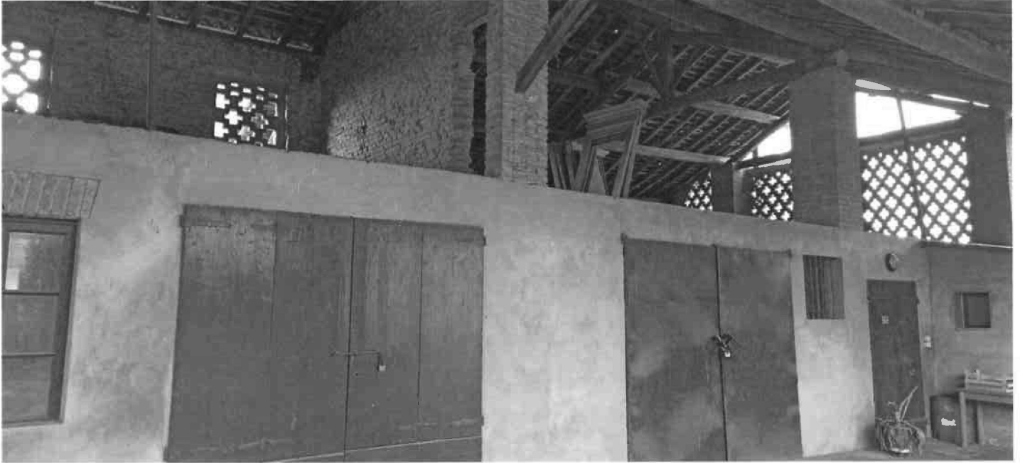
VISTA FACCIATA PRINCIPALE DA PORTICO COMUNE SUB. 21