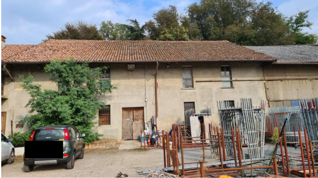
Magazzini – sub 20