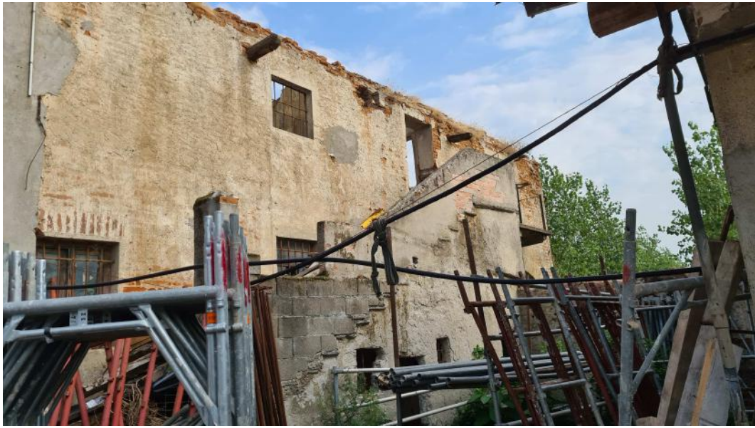
Unità collabente – sub 22