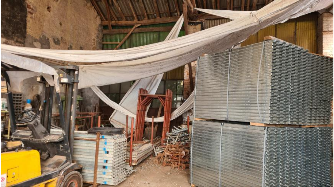
Laboratorio – sub 21