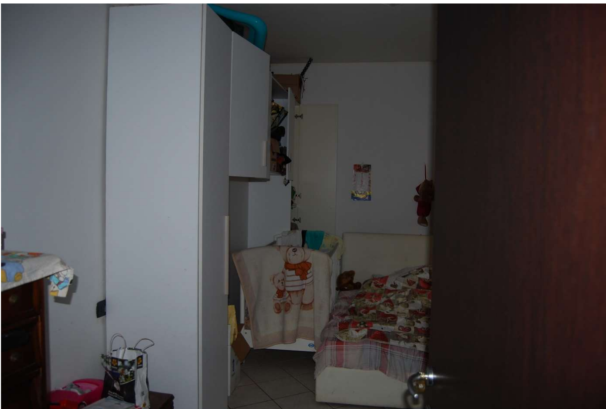
LOTTO 2 - Cucina, camera, alloggio sub.2, piano 1°, foto 27-28)