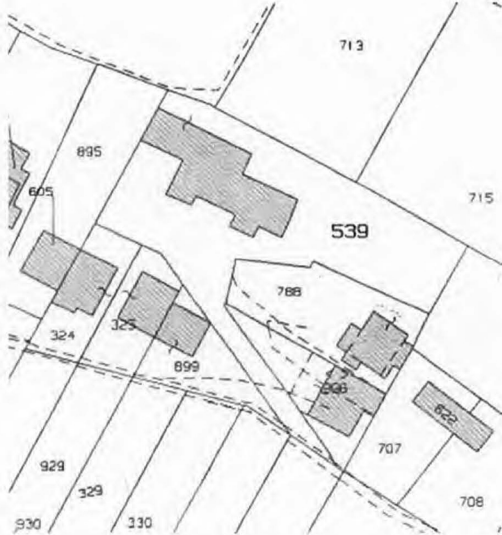
FIGURA 1: ESTRATTO MAPPA